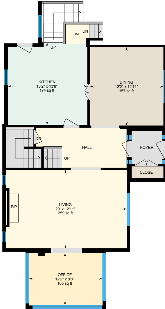
Main Floor Exterior Area 1010.91 sq ft

Main Building: Total Exterior Area Above Grade 2935.99 sq ft