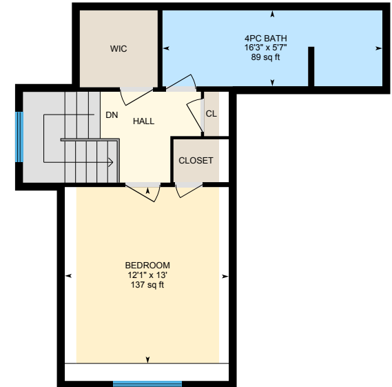
3rd Floor Exterior Area 421.52 sq ft