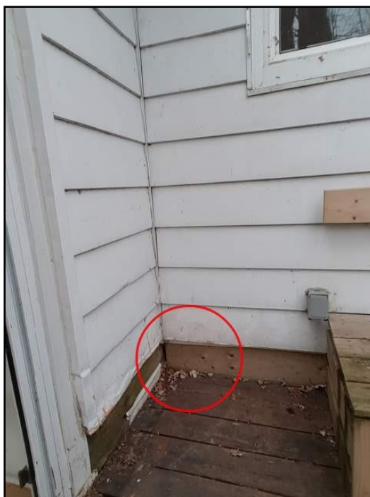
4. Flashings incomplete