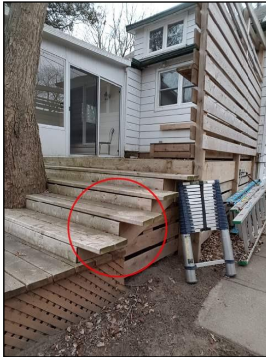
5. Missing guardrail