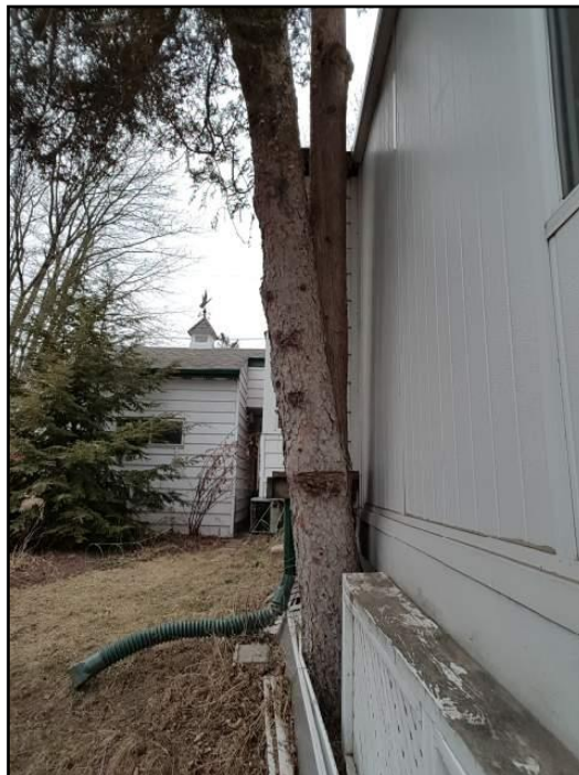
6. Trees or shrubs too close to building