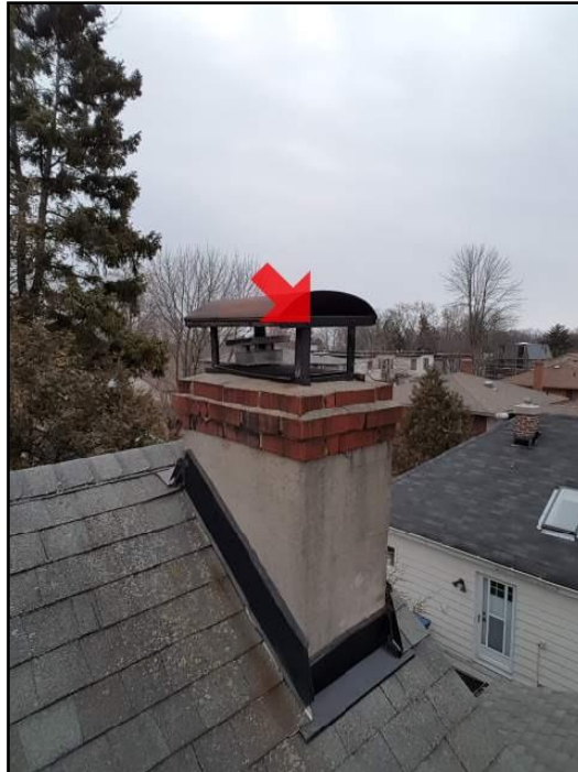
8. Unlined flue