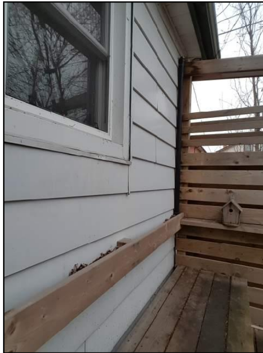
9. Poor vent pipe arrangements