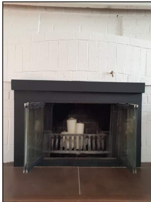
7. Wood-burning fireplace