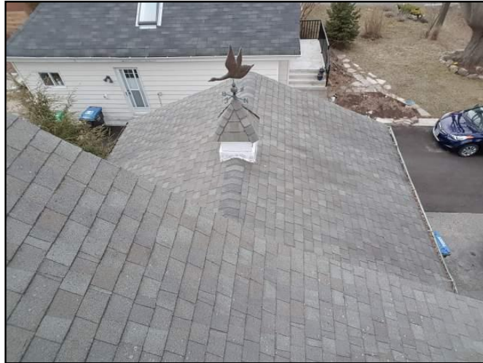
1. Asphalt shingles