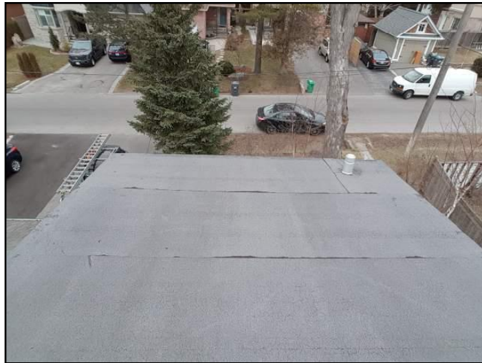
2. Modified bitumen membrane