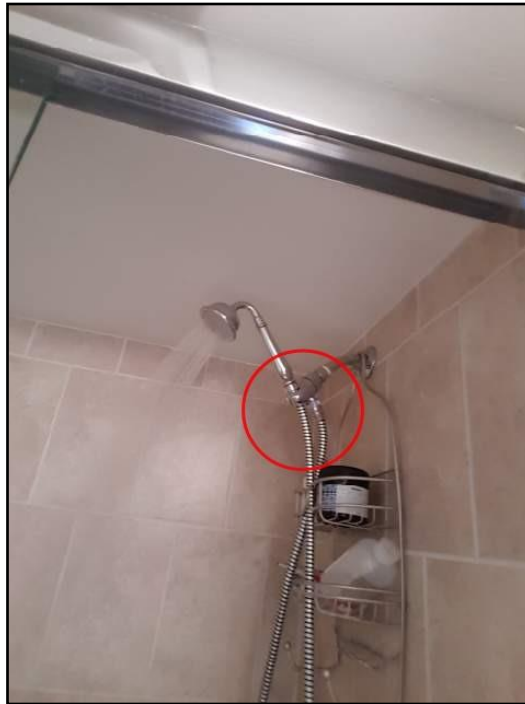
10. Drip, leak