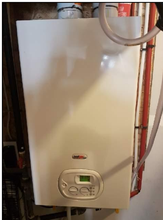
2. Tankless water heater

This unit also provides the heated water for transfer to forced air heating system.