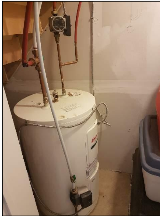
3. Circulating system

Waste and vent piping in building: • ABS plastic