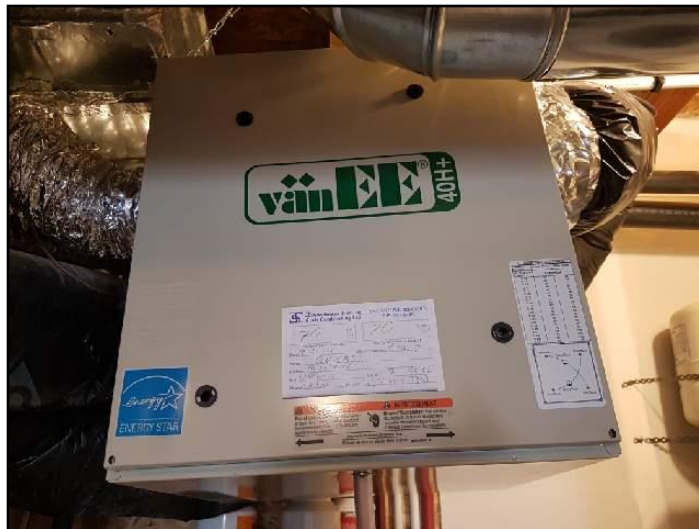
1. Heat recovery ventilator (HRV)